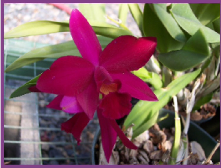
C. Landate x Lc. Little Princess