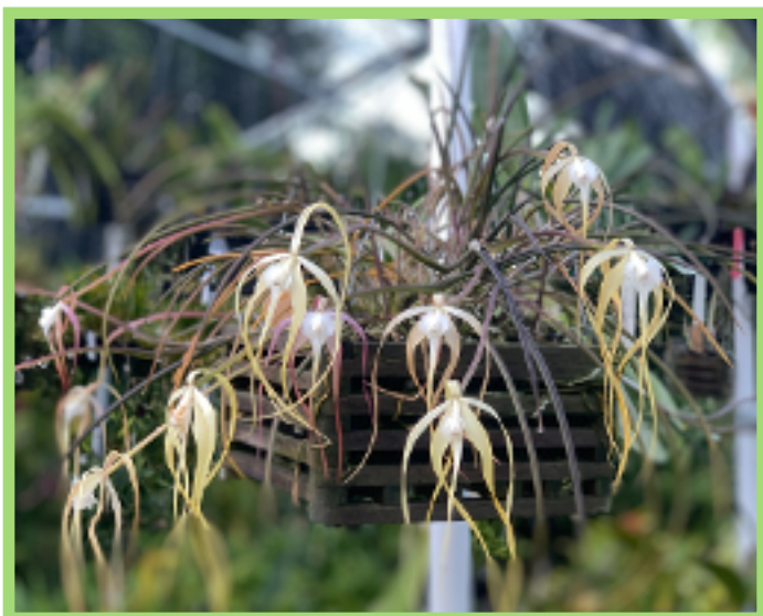
B. cucullata 'Pinkie'