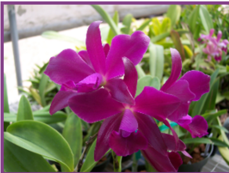
C. Bactia 'Grape Wax'