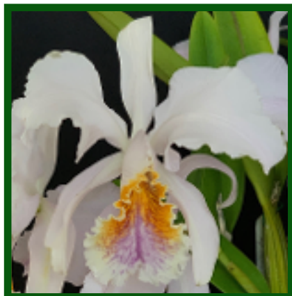
C. mossiae v. coerulea ('SVO' x 'Good Lip')