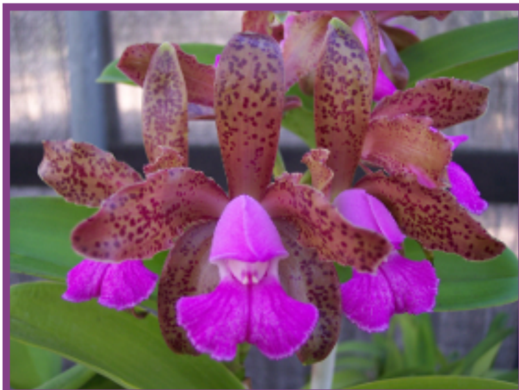
C. leopoldii sib cross