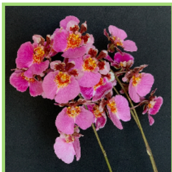
Tol. Elfin Gem x Rdm. Peach Hollow