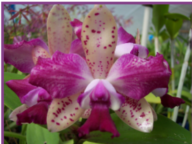
C. What'll It Be