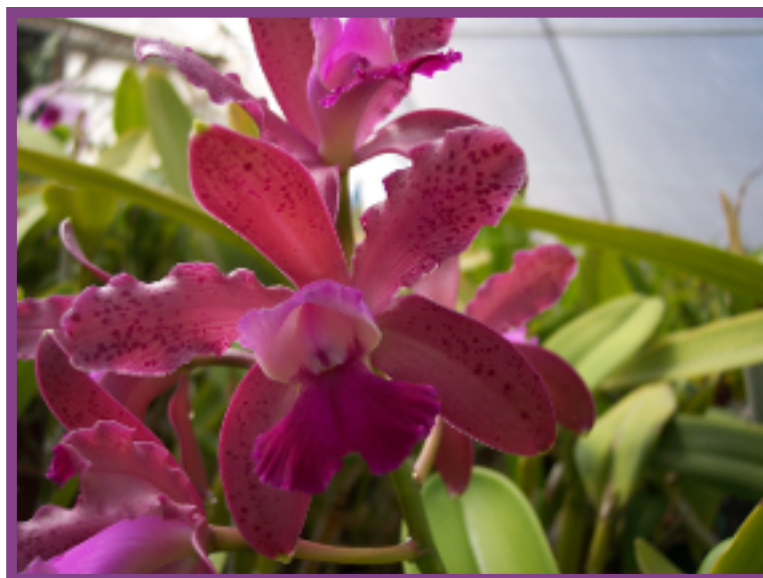
C. leopoldii x Lc. Cinnamon Stick