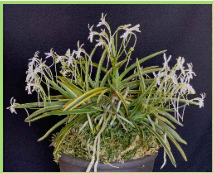
Neofinetia falcata 'GOJOFUKURIN'