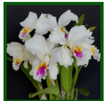
C. mossiae v. semi alba 'H&R'