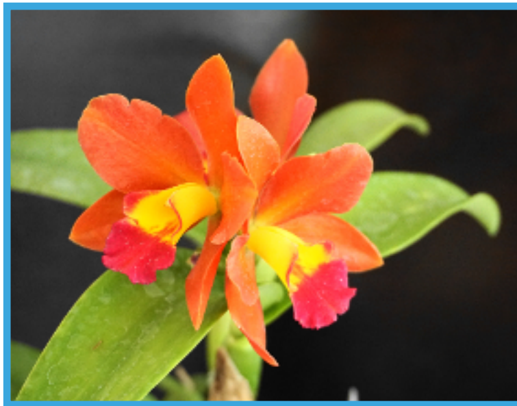
Pot. Burana Angel 'SVO #1' HCC/AOS X C. Chocolate Drop 'SVO' AM/AOS