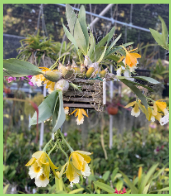
Euch. (Psh.) Marina