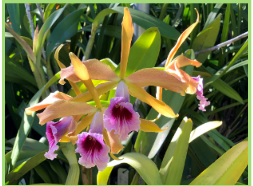
L. tenebrosa (typo x aurea) #1 x Walton Grange