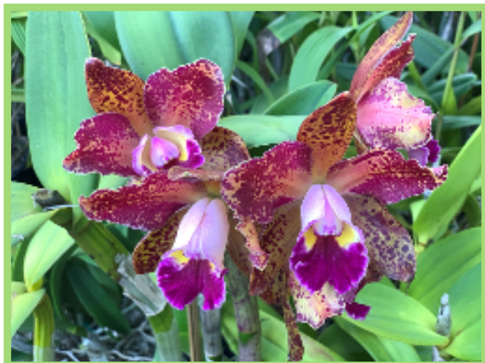
Blc. Waianae Leopard 'Ching Hua'